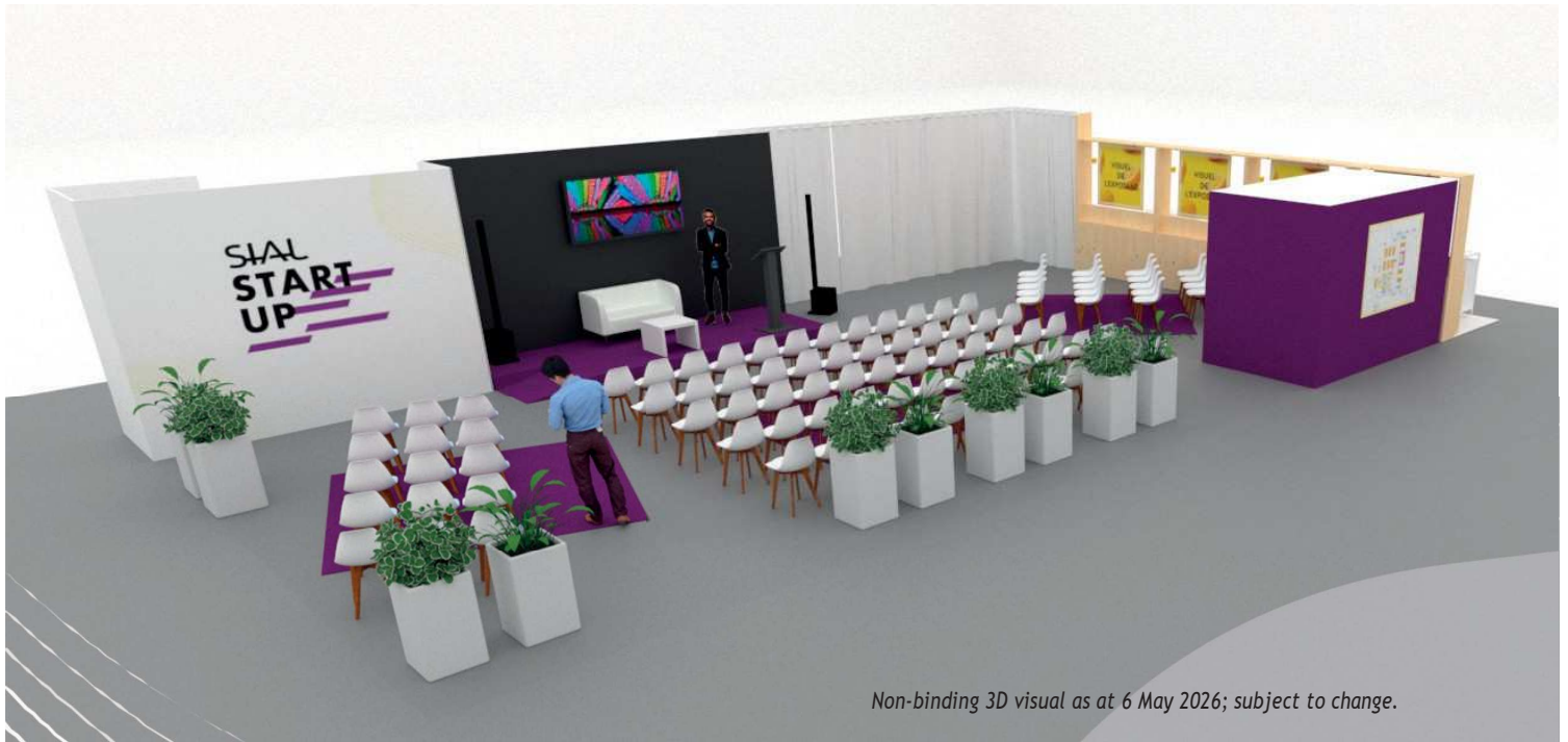
Non-binding 3D visual as at 6 May 2026; subject to change.

At the heart of the Village, the SIAL Pitch stage will bring together start-ups, investors, incubators and experts over five days for a programme dedicated to food innovation.